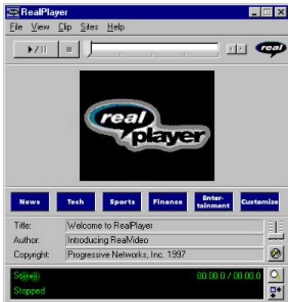
Overview of RealPlayer

The RealPlayer enables you to listen to RealAudio files and view RealVideo files over the Internet or over a local area network in real time, without downloading the clip to your hard drive. When you click a RealAudio or RealVideo link from a World Wide Web page, your RealPlayer automatically opens and plays the file you have selected.